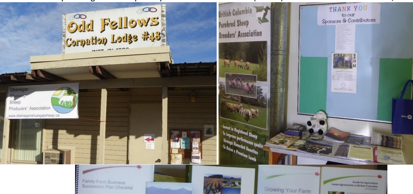
Some of the handouts available.