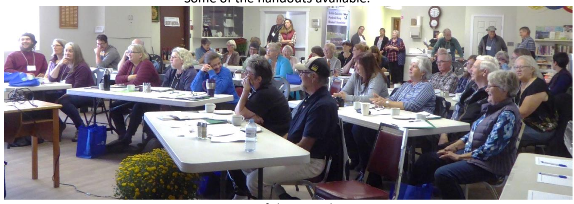
Some of the attendees.