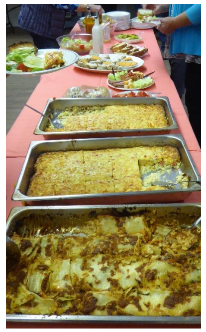
Saturday Lunch Yummy!